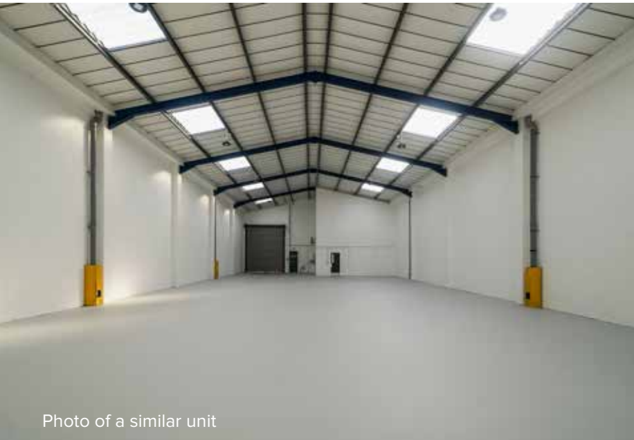
Photo of a similar unit